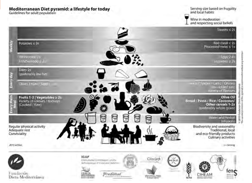
Figure 3 - The Mediterranean Diet pyramid, 2010

Source: Eighth International Congress on the Mediterranean Diet, Barcelona, 2010.